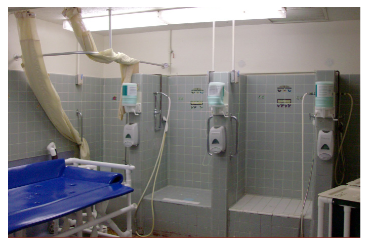
Old shower stalls in the HMC Long Term Care facility.

and to the staff and nurses currently utilizing the old showers, this is a great achievement.