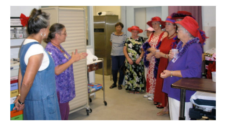
(above) Papale 'Ula 'Ula O Ka'u and the Ka Lea Quilters tour Ka'u Hospital during 2007 fundraising campaign launch.

Papale 'Ula 'Ula O Ka'u (Red Hats of Ka'u) and the Ka Lea Quilters held their final Spaghetti Feed on February 22, marking 10 years of raising funds to benefit the Ka'u Hospital. Over the years, the women's groups, teaming up with the Ka'u Hospital Charitable Foundation, Inc., raised monies to purchase a pediatric code cart, vital signs monitors, three exam lights for the Emergency Department, a portable x-ray machine, piped-in oxygen in the ED and other improvements. In 2008, the women's husbands joined the cause and launched a golf tournament at Volcano Golf and Country Club.