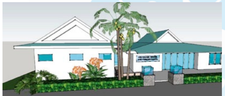
Architect's rendition of the renovated Kona Community Hospital Medical Oncology Clinic and Infusion Center.

The Kona Hospital Foundation is dedicated to improving Kona Community Hospital for the entire community. Their mission is to fund medical technology, expanded services and enhanced facilities that would otherwise be unavailable. Since its inception, the Foundation has donated over $5M dollars towards numerous projects that have improved the hospital. Major endeavors include the Adopt-A-Room project, the Radiation Oncology Center, Imaging Center, Nuclear Medicine Suite, and Outpatient Chemotherapy Building.