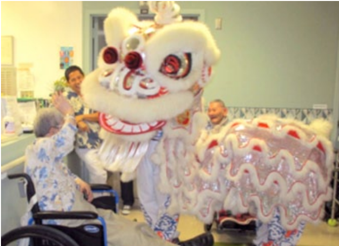
Looking on as the lion visited several different residents on the 3rd floor.