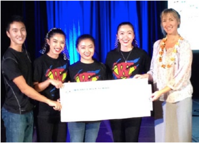
Students from Waiakea High School present a $1,000 check to improve HMC's pediatric unit.