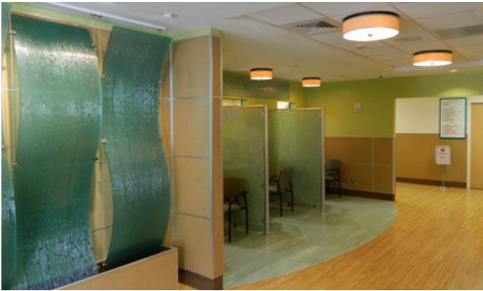
Newly Renovated Admitting Department Waiting Area