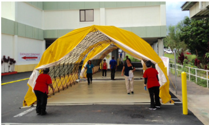
KCH Staff Set up Emergency Triage Tent