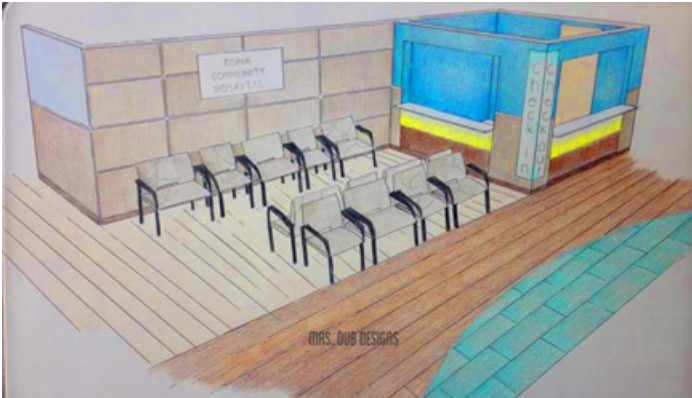
Design Rendition of ED Expansion and Renovation