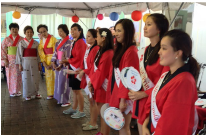
The 61st Blossom Court and the Shin Koku Kai Dance Club highlighted the 2013 Bon Dance event.