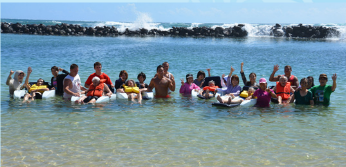
Woodbridge High School football and Okinawa Prefectural College nursing students assist in SMMH residents outing.